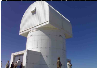
Department of Earth and Planetary Sciences of the National Observatory of Athens, with a diameter of 2.60 m and a height of 23 m.