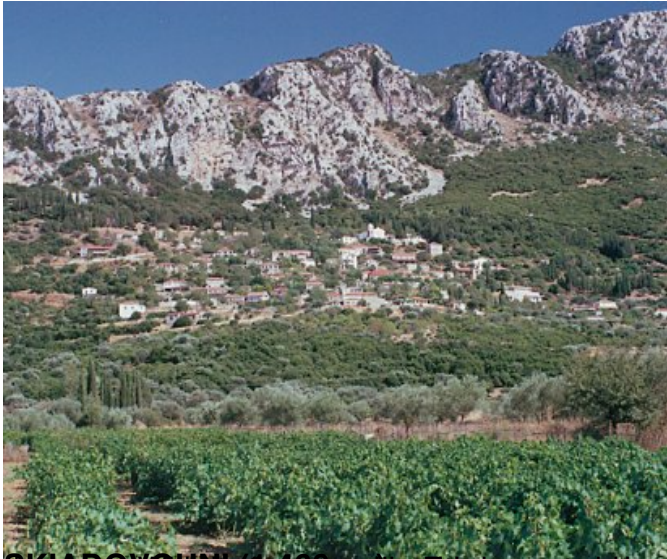
SKIADOVOUNI (1495m) Ionia Region extending to 46 km, and Skopos Mountain to the left, its area face